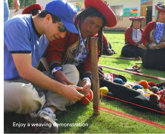
Enjoy a weaving demonstration

“I will confidently book with EF knowing that they truly have the infrastructure to handle a crisis, that they care deeply for the students, and that they remain committed to sharing the wonder of travel.”