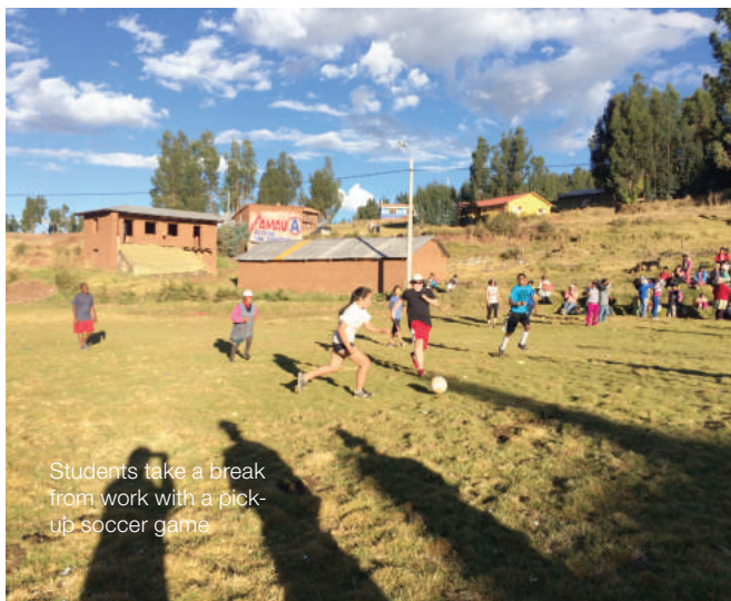
Students take a break from work with a pick-up soccer game