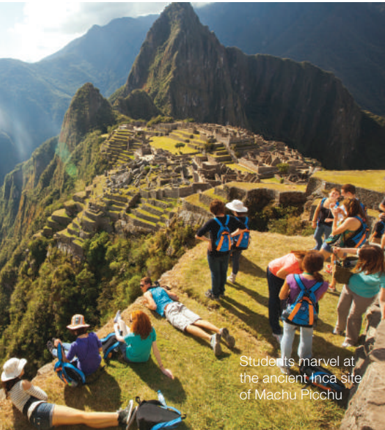
Students marvel at the ancient Inca site of Machu Picchu