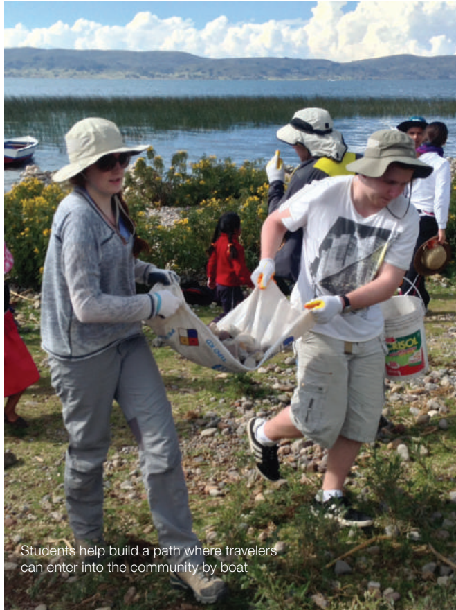
Students help build a path where travelers can enter into the community by boat